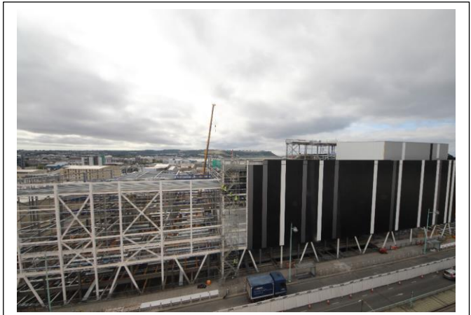
View from Primark.