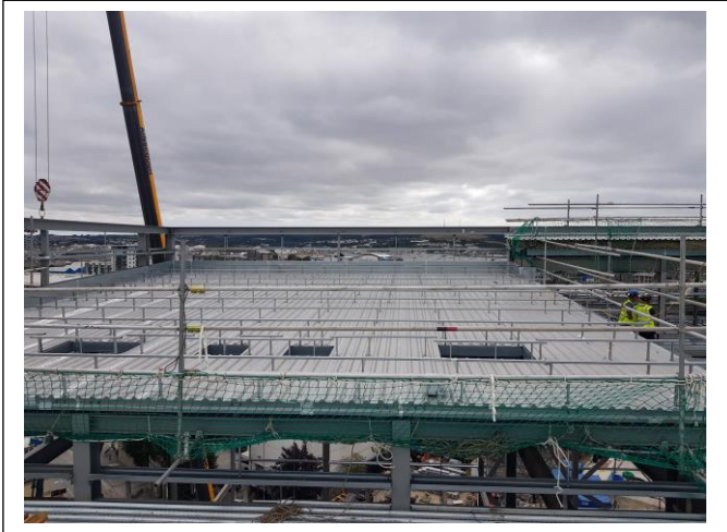
Roof on Phase 3