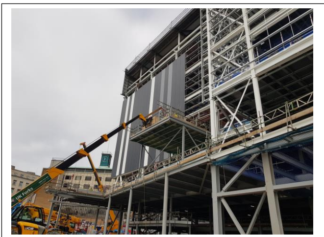
Cladding to Bretonside elevation.