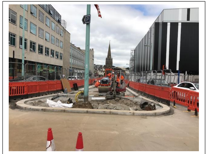
St Andrew Cross nearing completion