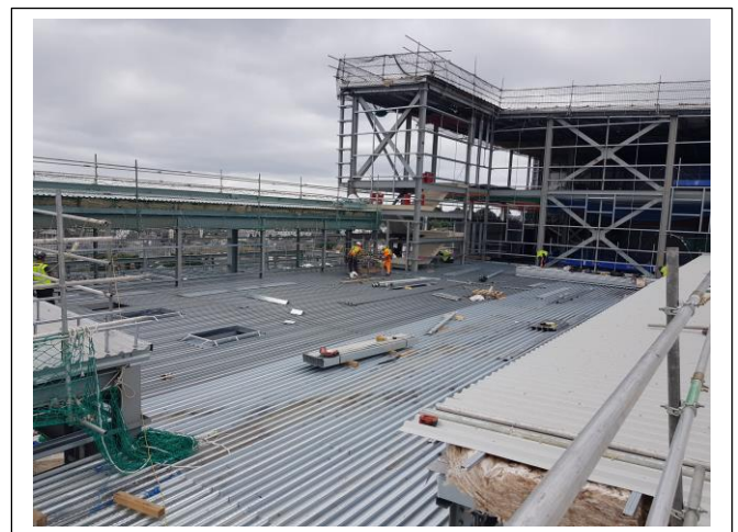
Metal decking continues on plant deck.