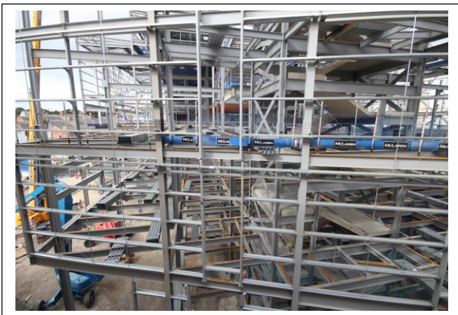
View from Gala Bingo.